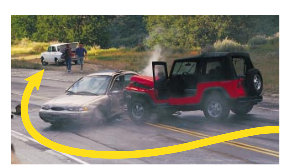
Move well beyond the wreck, and park out of harm's way. Use your flashers, raise your hood or trunk, and watch for traffic, fire and wires.