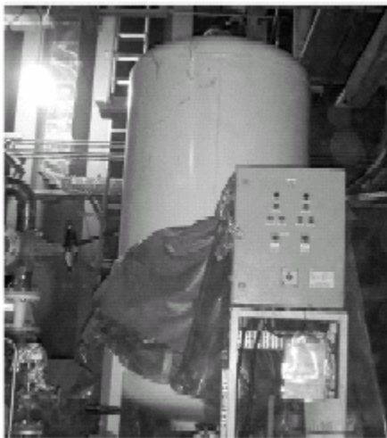
Fresh water hydrophore tank