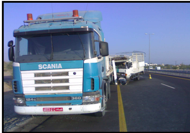
Front view of canter vehicle embedded in trailer.

On the 17 th October at 1.00am a HGV driver travelling on a main highway was pulled over on to the hard shoulder by the police for a routine documents check. On completing the check the driver stood at the rear of his trailer waiting to return to his vehicle. A third party canter vehicle drifted onto the hard shoulder, struck the police car and crashed into the driver and rear of the trailer.